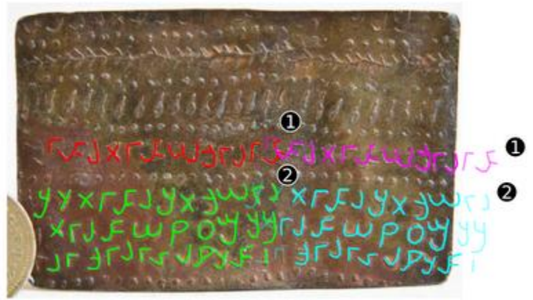
Note the overlap.