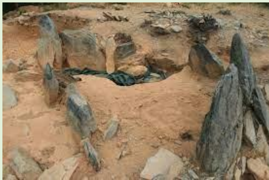
Anta da Lajinha, Mação

14h30 – APHELEIA Board meeting (restricted)