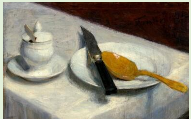
Henri Fantin-Latour, Still Life with Mustard Pot (1860)